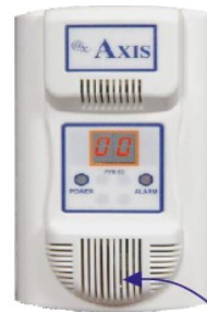
Kordon Tip Recommends

The history data table saves all parameters, cycle steps, warning messages, cycle reports, etc up to the last one year working.