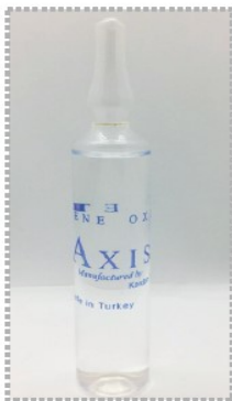
The ends of the Axis ethylene oxide ampoules are sealed with hermetic sealing technique.

Axis EO Gas Sterilizers works with; Axis Ampoule Sets (ARQ series) and these are consists of; -Liner bag and tie-wrap -100% Gas Ampoule of 24g -Humidity Chip -Dosimeter Indicator (optional)