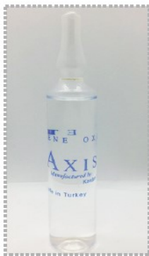
The ends of the Axis ethylene oxide ampoules are sealed with hermetic sealing technique.

Axis EO Gas Sterilizers works with; Axis Ampoule Sets (ARQ series) and these are consists of; -Liner bag and tie-wrap -100% Gas Ampoule of 11g or 5g -Humidity Chip -Dosimeter Indicator (optional)